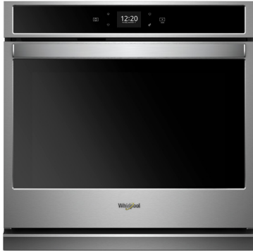
Stainless Steel WOS51EC0HS