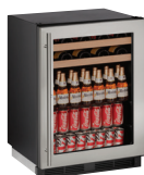
STAINLESS FRAME (LOCK)