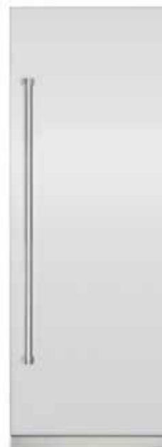
Shown with optional stainless steel door panel kit