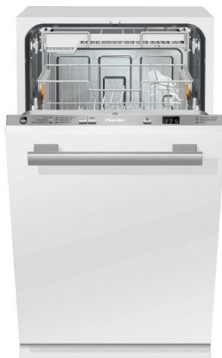
G 4780 SCVi Item 21478062USA