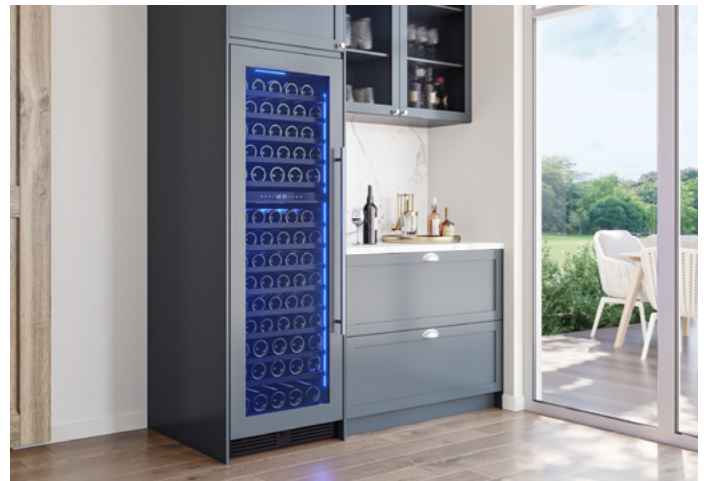
Accommodates custom wood overlay panels