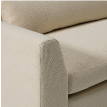
LOOSE SEAT CUSHIONS