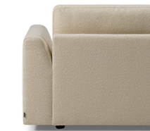
ENGINEERED WOOD FRAME