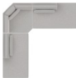
20/9W/19 117 x 117" 298 x 298 cm