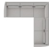
B2/9B/B3 116 x 116" 295 x 295 cm