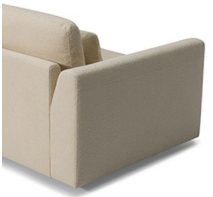
SINGLE NEEDLE TOP STITCHING