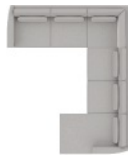
B4/90/15 111 x 140" 282 x 356 cm