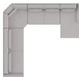
A2/9W/90/15 147 x 140" 374 x 356 cm