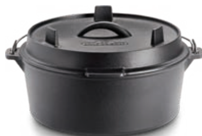
CAST IRON DUTCH OVEN