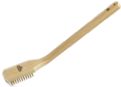
GRILL BRUSH WITH BRASS BRISTLES