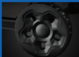
Rugged All Terrain Wheels