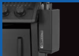
Folding Side Shelf