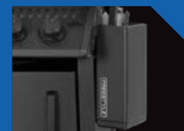
Folding Side Shelves