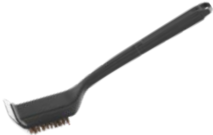
GRILL BRUSH WITH PALMYRA BRISTLES