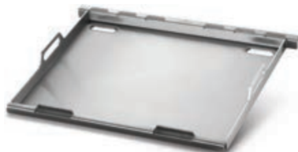
STAINLESS STEEL GRIDDLE INSERT