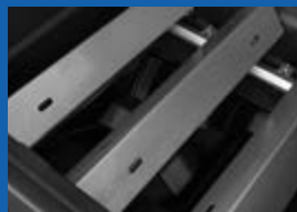
Stainless Steel Sear Plates