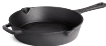
CAST IRON FRYING PAN