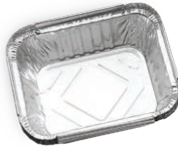
5 PK. BBQ DRIP TRAYS