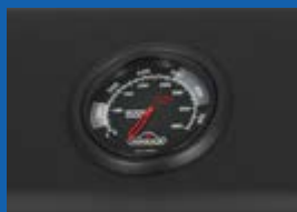
ACCU-PROBE™ Temperature Gauge