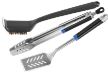
ESSENTIAL 3 PIECE TOOL SET