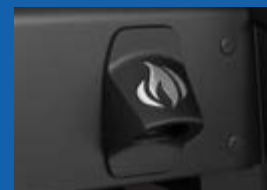
Integrated Bottle Opener