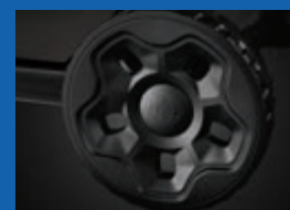
Rugged All Terrain Wheels