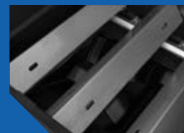
Stainless Steel Sear Plates