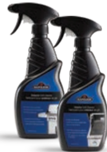
INTERIOR/EXTERIOR GRILL CLEANER