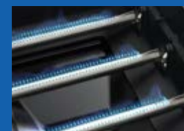
Stainless Steel Burners