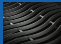
Porcelainized Cast Iron Iconic WAVE™ Cooking Grids