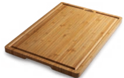
BAMBOO CUTTING BOARD