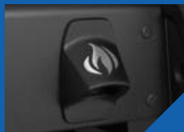
Integrated Bottle Opener