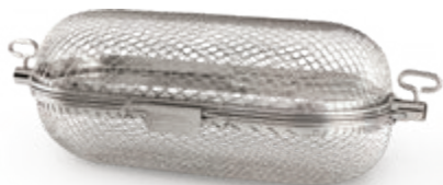
ROTOISSERIE GRILL BASKET