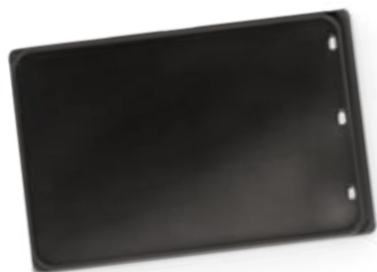
CAST IRON GRIDDLE INSERT

Effortlessly convert your grill with our Premium Stainless Steel Griddle Insert. Ideal for searing, sautéing, and stir-frying, this griddle offers a generous cooking surface and provides ample space to cook with ease. Achieve an epic sear on steaks, cook juicy burgers, full breakfasts, and more. Enjoy a reliable cooking experience thanks to thick stainless steel construction and even heat distribution, plus the integrated grease traps capture drippings for easy cleanup. Save space and money, convert your existing grill into a griddle in a snap.