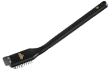
GRILL BRUSH WITH STAINLESS STEEL BRISTLES