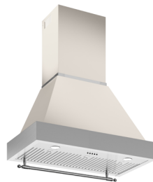
K36HERTX + KC36HERTAV Ivory gloss canopy