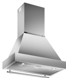
K36HERTX + KC36HERTX Stainless steel canopy