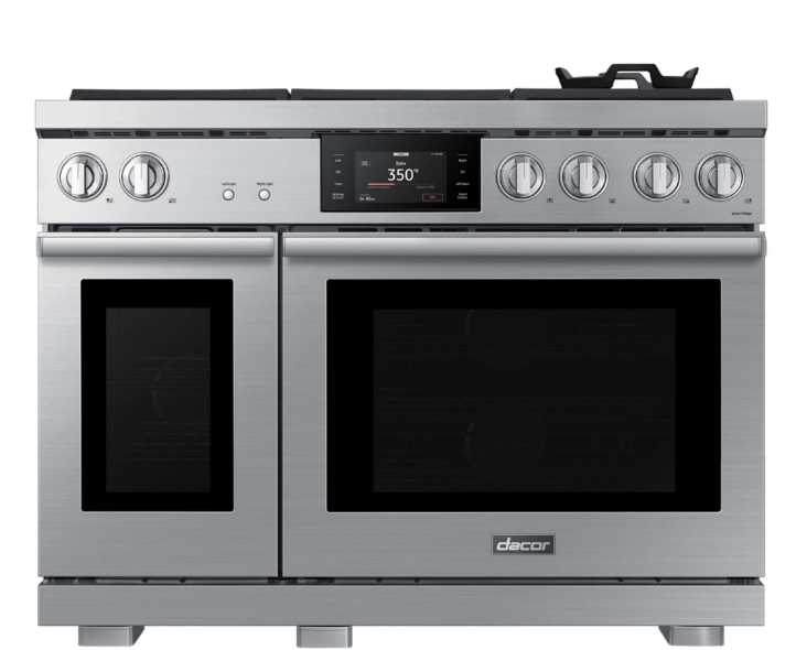
DOP48T960DS/DA – Silver Stainless, Natural Gas/Liquid Propane