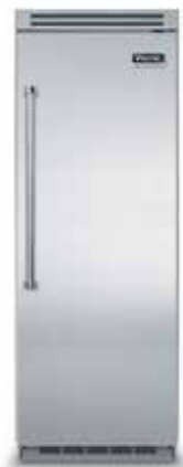
30"W. All Freezer