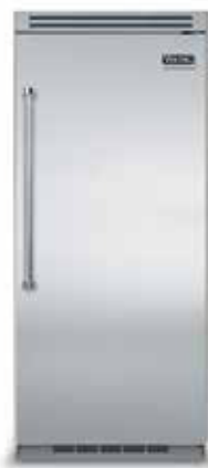
36"W. All Refrigerator