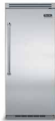
36"W. All Freezer