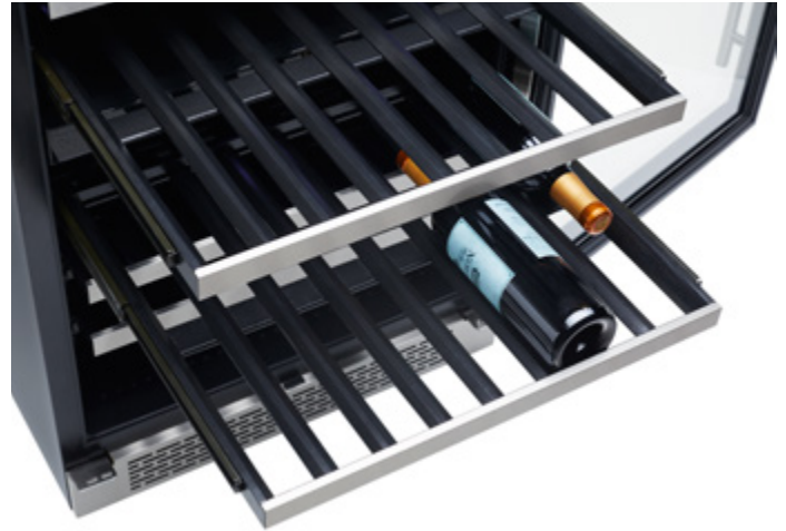
Full Extension Wood Rack