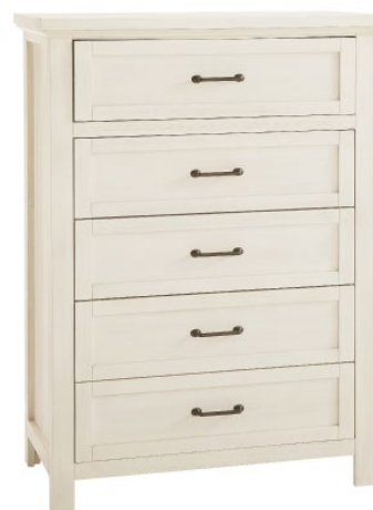
Five Drawer Chest