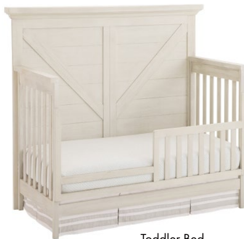
Toddler Bed (toddler rail sold separately)