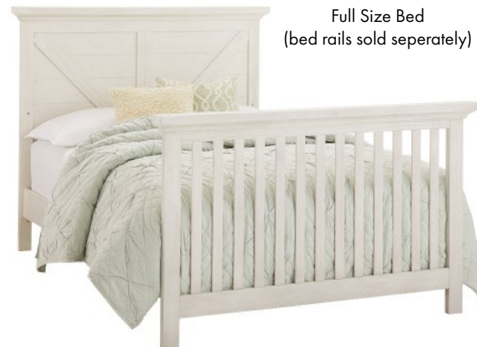
Full Size Bed (bed rails sold separately)