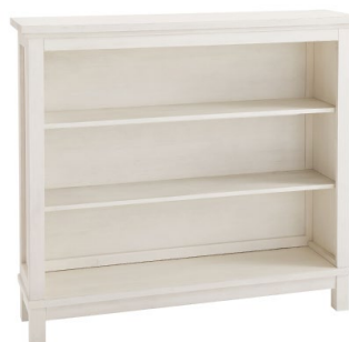
Hutch/Bookcase shown alone and on top of dresser