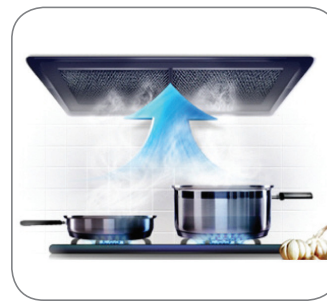
300 CFM Ventilation System