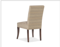
Fabric shown: MP024-83 Pravin Taupe Finish: Perk