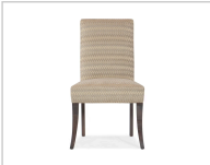
Fabric shown: MP024-83 Pravin Taupe Finish: Perk