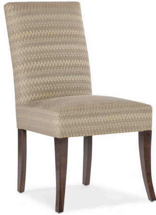
Fabric shown: MP024-83 Pravin Taupe Finish: Perk