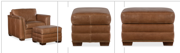
Leather shown: 919600-84 Finish shown: New Classiques Natural Nails