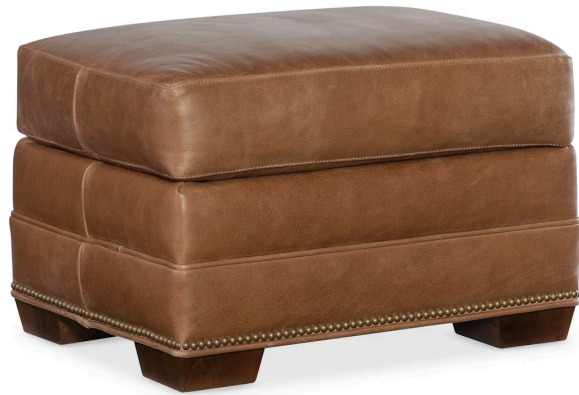
Leather shown: 919600-84 Finish shown: New Classiques Natural Nails