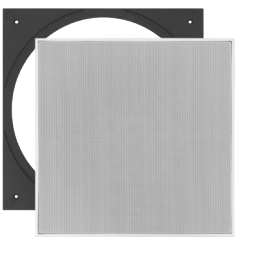
VPXT8SQ SKU 93343