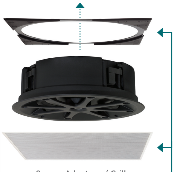
Square Adapter w/ Grille