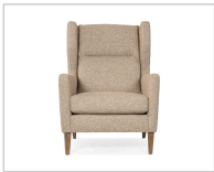
Fabric shown: MT034-07 Taj Caramel Finish: Toffee