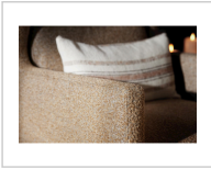
Fabric shown: MT034-07 Taj Caramel Finish: Toffee