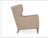
Fabric shown: MT034-07 Taj Caramel Finish: Toffee