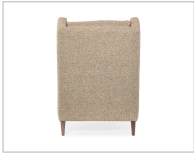
Fabric shown: MT034-07 Taj Caramel Finish: Toffee