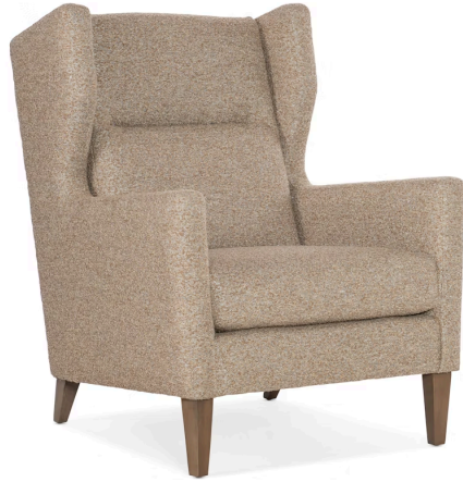
Fabric shown: MT034-07 Taj Caramel Finish: Toffee