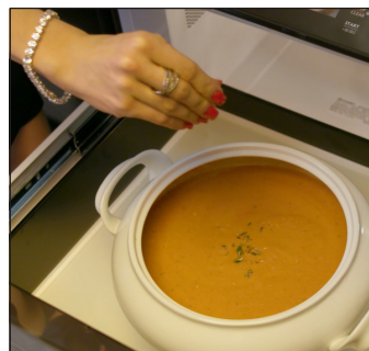
Generous 17" x 16" interior is perfect for platters, casseroles & serving bowls.