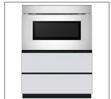
Pedestal Accessory slides under the counter for hassle-free installs.