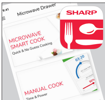
SHARP KITCHEN MOBILE APPLICATION keeps you in control.

The SMD2479KSC Sharp Microwave Drawer™ oven features Built-In Airflow venting. Now you can choose the traditional "proud mount" installation or flush mounting for a streamlined finish without additional trim kits or vent deflectors. The optional pedestal accessory for the SMD2479KSC slides into a standard dishwasher cutout for a built-in look without the need for custom cabinetry.