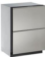
INTEGRATED SOLID (STAINLESS HANDLELESS PANEL)*