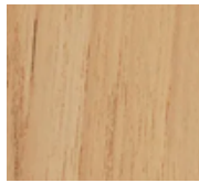
Natural Teak (New)