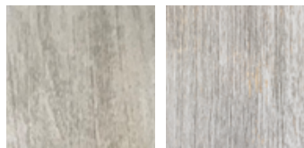
Driftwood Teak (1 Year)