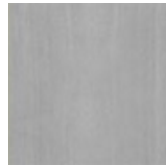
Natural Teak (1 year)