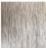
Driftwood Teak (New)