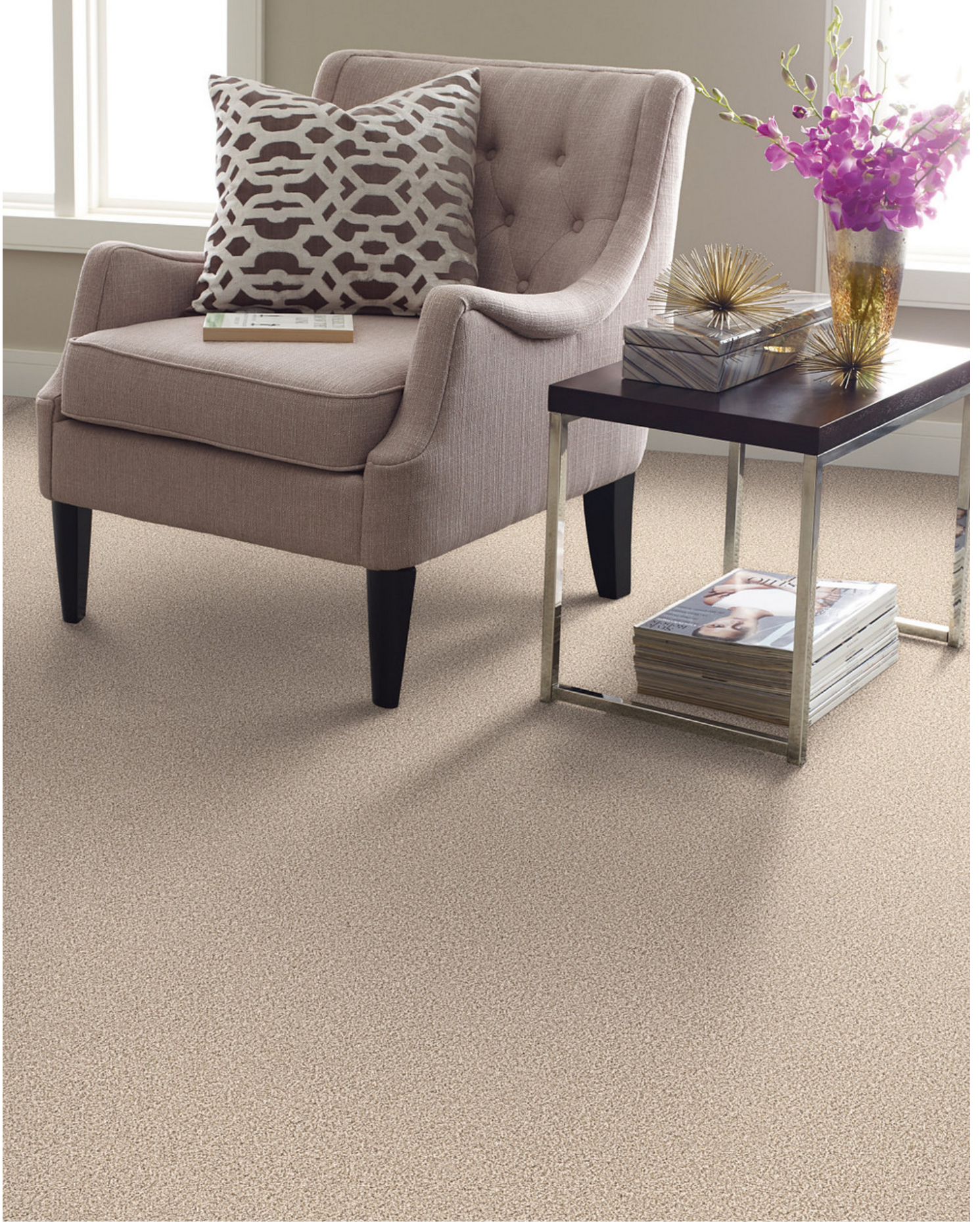
101 Goose Feather