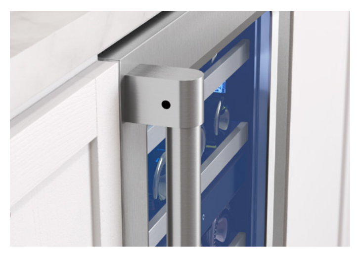
Door Lock in Pro-Style Handle