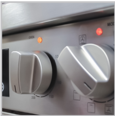
Heavy Duty Control Knobs