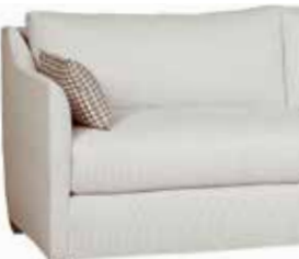
NEWLIN (655) Grand Scale: 23.5" Seat Depth

Track Arm, To The Front Cushion, French Seam Border Back/Border Cushion, 20" Throw Pillows ( lipstitch )