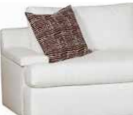
CREW (664) Plush Scale: 24"+ Seat Depth

Channeled Arm, To The Front Cushion, French Seam Border Back/Border Cushion, 20" Throw Pillows ( lipstitch ), Floating Base ( no other base options )