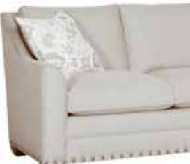
NICHOLAS (644) Grand Scale: 23.5" Seat Depth

Small Track Arm, T-Cushion, Welted* Border Back/Border Cushion, 20" Throw Pillows ( welted square corner )