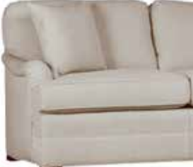
EAST LAKE (603) Classic Scale: 22" Seat Depth

Panel Arm, To The Front Cushion, Welted* Border Back/Border Cushion, 20" Throw Pillows ( welted square corner )