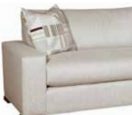
PAXTON (674) Plush Scale: 24"+ Seat Depth

Wing Track Arm, To The Front Cushion, French Seam Border Back/Border Cushion, 21" Throw Pillows ( lipstitch )