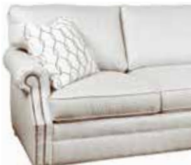
GUTHERLY (648) Grand Scale: 23.5" Seat Depth

Track Arm, To The Front Cushion, Welted* Border Back/Border Cushion, 20" Throw Pillows ( welted square corner )