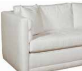
TENLEY (660) Grand Scale: 23.5" Seat Depth

Tight Back with Swoop Arm, To The Front Cushion, Welted, 20" Throw Pillows ( welted square corner )