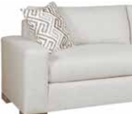
CLAREMONT (654) Grand Scale: 23.5" Seat Depth

Track Arm, To The Front Cushion, French Seam Border Back/Border Cushion, 21" Throw Pillows ( lipstitch )