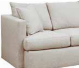
EMORY (659) Classic Scale: 22" Seat Depth

Mid Century Arm, To the Front Cushion, French Seam Border Back/Border Cushion, 20" Throw Pillows ( lipstitch ) Not available with Dressmaker Skirt.