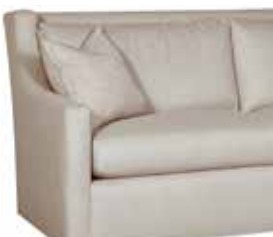
CORBY (667) Plush Scale: 24"+ Seat Depth

Box Arm, T-Cushion, French Seam Border Back/Border Cushion, 21" Throw Pillows ( lipstitch ), Floating Base ( no other base options )