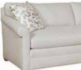
ROSLYN (662) Classic Scale: 22" Seat Depth

Recessed Track Arm, To the Front Cushion, French Seam Knife-Edge Back/French Seam Border Cushion, 20" Throw Pillows ( lipstitch ), Floating Base ( no other base options )