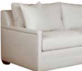
CONNELLY SPRINGS (656) Grand Scale: 23.5" Seat Depth

Wedge Arm, To The Front Cushion, French Seam Border Back/Border Cushion, 12"x23" Arm Bolsters ( lipstitch )