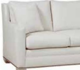
BROOKFORD (657) Classic Scale: 22" Seat Depth

Greek Key Arm, To The Front Cushion, Welted* Border Back/Border Cushion, 20" Throw Pillows ( welted square corner )