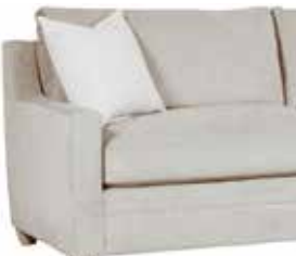
FAIRGROVE (652) Grand Scale: 23.5" Seat Depth

Scoop Roll Arm, To The Front Cushion, Welted* Knife-Edge Back/Border Cushion, 20" Throw Pillows ( welted square corner )