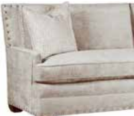
RIVERSIDE (604) Grand Scale: 23.5" Seat Depth

Rolled Arm, To the Front Cushion, French Seam Border Back/Border Cushion, 21" Throw Pillows ( lipstitch )