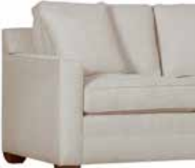
SUMMERTON (610) Classic Scale: 22" Seat Depth

English Arm, T-Cushion, Welted* Knife-Edge Back/Border Cushion, 20" Throw Pillows ( welted square corner ) Not available with Metro, Mid Metro, Short Metro or Metal Cylinder Legs.