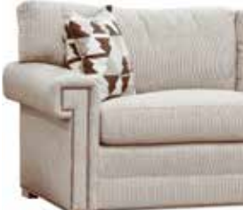
DAVIDSON (622) Classic Scale: 22" Seat Depth

Modern Arm, To The Front Cushion, Welted* Border Back/Border Cushion, 20" Throw Pillows ( welted square corner )