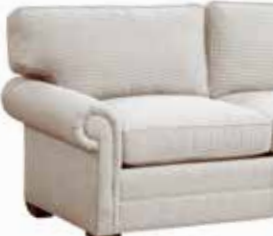
MAIN STREET (601) Classic Scale: 22" Seat Depth

Track Arm, To The Front Cushion, Welted* Border Back/Border Cushion, 20" Throw Pillows ( welted square corner )