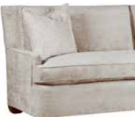
HENLEY (675) Plush Scale: 24"+ Seat Depth

Track Arm, To The Front Cushion, French Seam Border Back/Border Cushion, 20" Throw Pillows ( lipstitch )