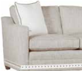
STANTON (647) Grand Scale: 23.5" Seat Depth

Wedge Arm, To The Front Cushion, Welted* Border Back/Border Cushion, 20" Throw Pillows ( welted square corner )