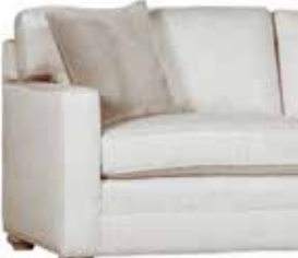
HILLCREST (600) Classic Scale: 22" Seat Depth

Track Arm, To The Front Cushion, Welted* Border Back/Border Cushion, 20" Throw Pillows ( welted square corner )