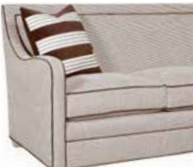
HADEN (658) Grand Scale: 23" Seat Depth

Track Arm, To The Front Cushion, French Seam Border Back/Border Cushion, 21" Throw Pillows ( lipstitch )