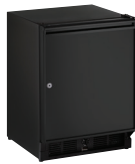
BLACK SOLID (LOCK)