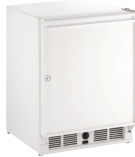
WHITE SOLID (LOCK)