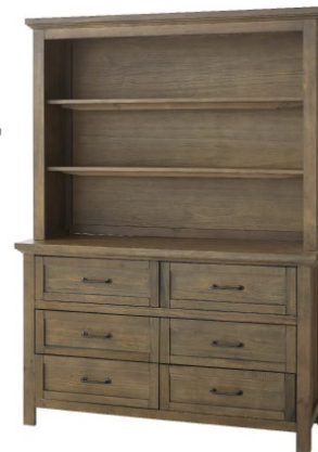
Hutch/Bookcase shown alone and on top of dresser