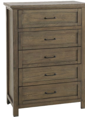
Five Drawer Chest