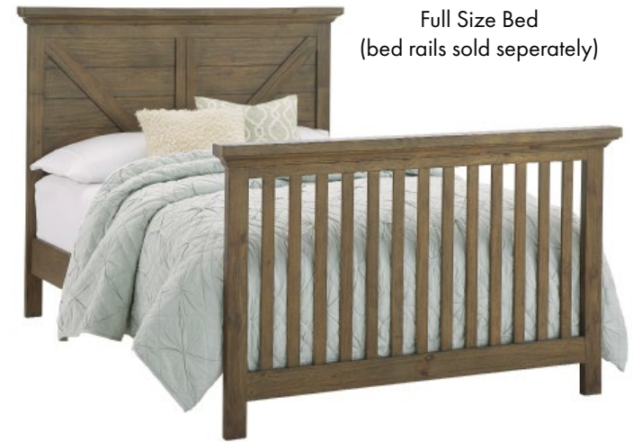
Full Size Bed (bed rails sold separately)