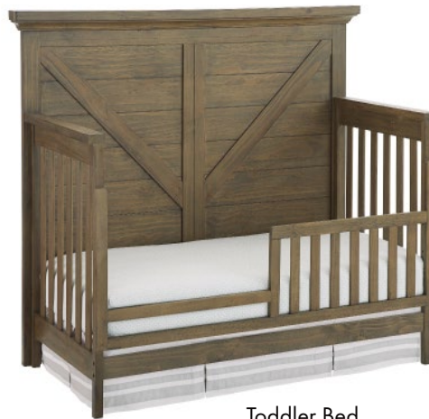
Toddler Bed (toddler rail sold separately)