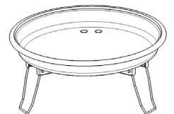
Air Fry Pan