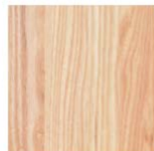
Clear Coat (CC-A...