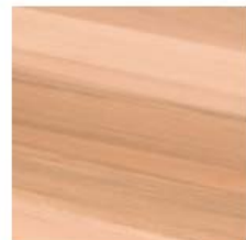
Clear Coat (CC-M)