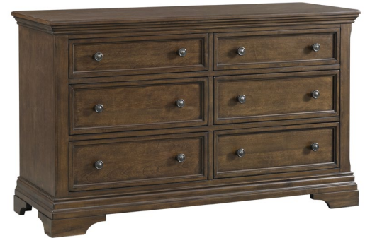
Six Drawer Dresser