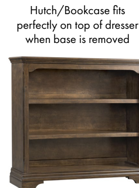
Hutch/Bookcase fits perfectly on top of dresser when base is removed