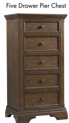
Five Drawer Pier Chest