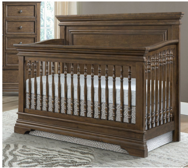
Convertible Crib (toddler rail sold separately)