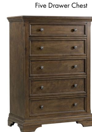
Five Drawer Chest