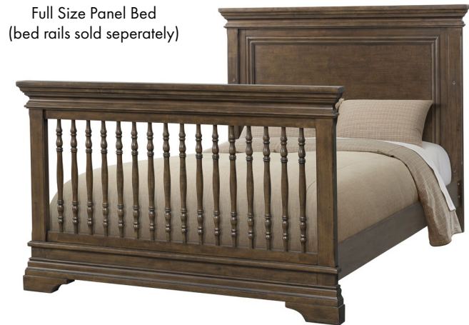
Full Size Panel Bed (bed rails sold separately)