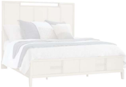
Kendall Queen Upholstered Storage Bed S952-BR-K2