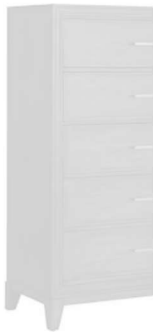
Lenox 5-Drawer Chest S964-040