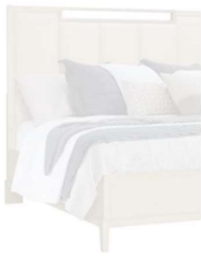
Kendall Queen Upholstered Bed S952-BR-K1