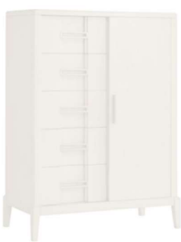
Kendall Sliding Door Chest with Drawers S952-041