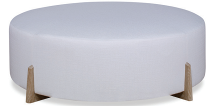
LRO2 Base shown