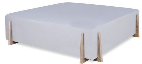
WRO3 Base shown (NA 16" Seat H)