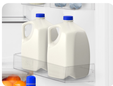
Gallon-Sized Door Bins