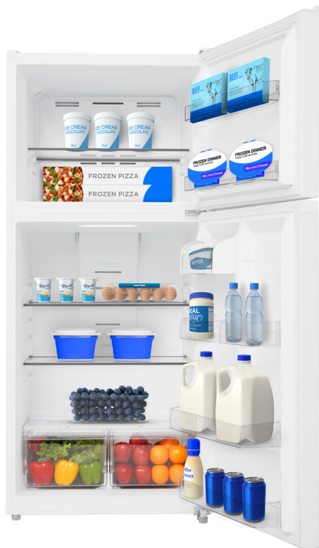
18 cu. ft. Capacity

Our 18 cu. ft. Top-Freezer Refrigerator offers ample storage space in a compact footprint, making it perfect for small kitchens and apartments. If you need secondary food storage for your garage or basement, this Garage Ready refrigerator delivers optimal performance in a wide range of temperatures.