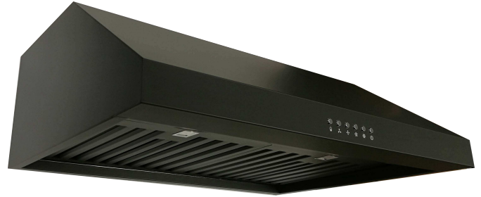
30" Matte Black