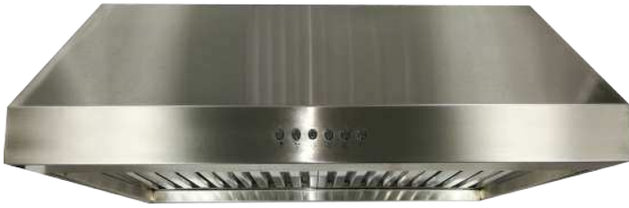
30" Stainless Steel