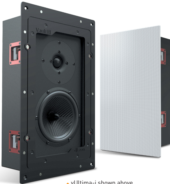
▲ vUltima-i shown above

Leon's Vault Series of in-wall speakers can be used to create high-performance home theater systems, or they can be used as rear channels to complement our Horizon™ or Profile™ Series speakers. Unlike other in-walls on the market, these fully sealed, acoustically dampened cabinets are hand-crafted from the finest materials and components to deliver uncompromising quality in both construction and performance. These unique in-wall speakers are easily installed pre- or post-construction and are available with paintable metal grills to perfectly match any color scheme. Equipped with high-performance woofers and tweeters, with several available upgrades, Leon's in-wall speakers provide a truly integrated sound solution.