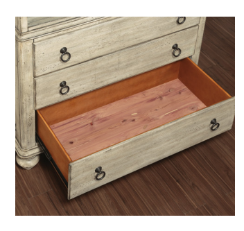
Media Chest W1047-866