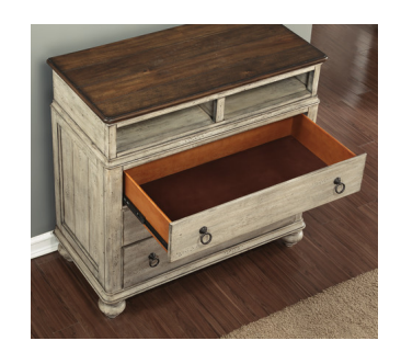
Media Chest W1047-866