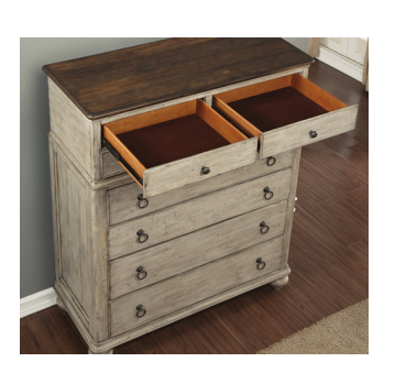
Drawer Chest W1047-872