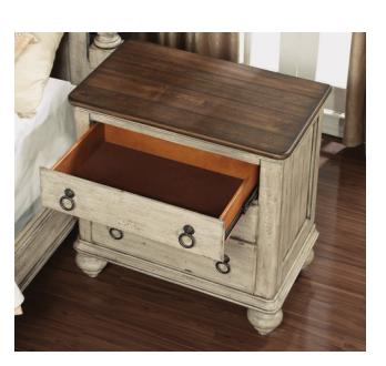
Night Stand W1047-863