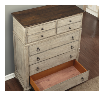
Drawer Chest W1047-872