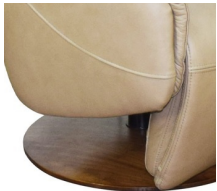
WALNUT WOOD PEDESTAL OPTION

Aluminum Brushed Metal Leg Aluminum Black Leg