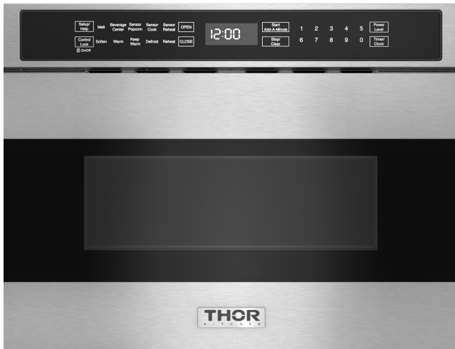
Product: 30 Inch Microwave Drawer in Stainless Steel Model Number: TMD3001