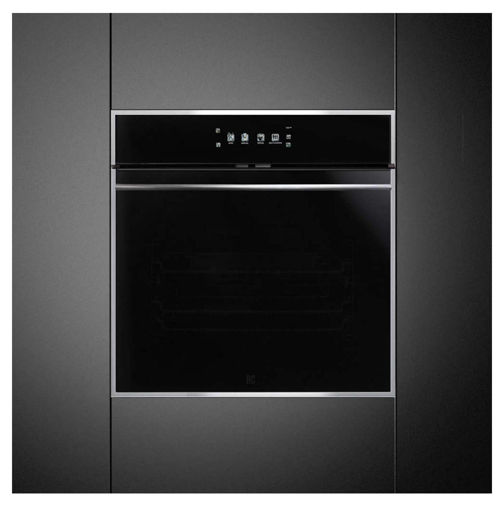
2021 SPECIFICATION SHEET