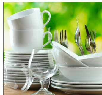
Heated Dry Option with a Dedicated Heating Element is Effective on Plastics and Minimizes the Need for Hand-Drying.

SHARP ELECTRONICS CORPORATION 100 Paragon Drive, Montvale NJ, 07645 1.800.237.4277 • www.sharppusa.com