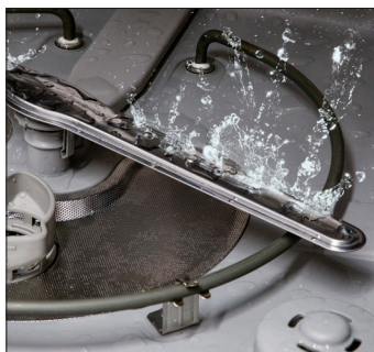
Durability Where it Matters Most. The Stainless Steel Spray Arm is Sturdy and Dependable.