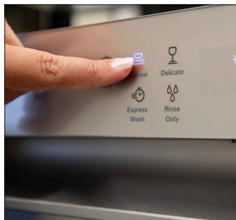
Conveniently Located in Front and Back-lit When in Use.

Classic and elegant, the SDW6504MS offers thoughtful touches inside and out. The adjustable upper rack holds larger dishes and taller glasses. The fold-down tines in the lower rack make it easier to load extra large or hard-to-fit items such as serving bowls and roasters. The SDW6504MS Stainless Steel Hybrid Dishwasher from Sharp is Simply Better Living!