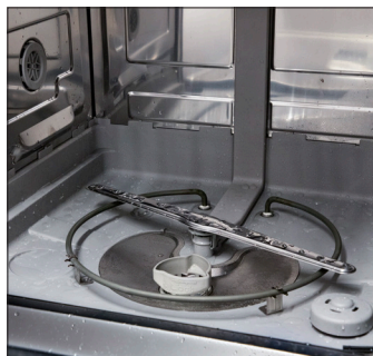
The Advanced Hybrid Tub Consists of Stainless Steel Interior with Heavy Duty Plastic Floor.