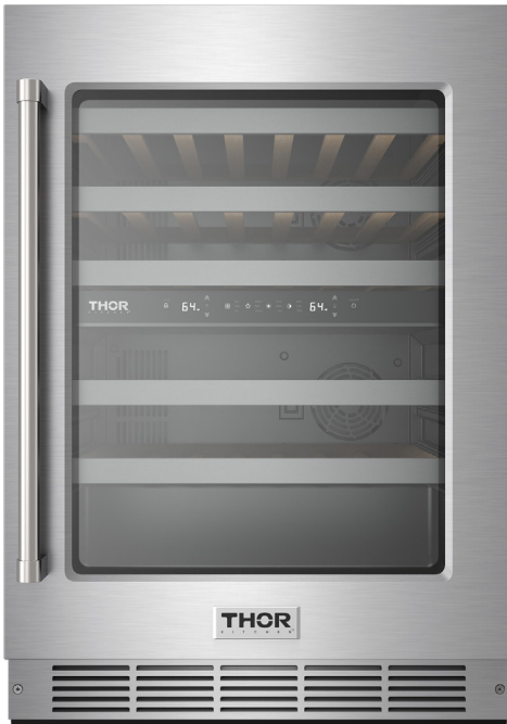
Product: 24 Inch Undercounter Dual Zone Wine Cooler Model Number: TWC24UD