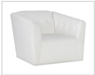
Fabric shown: MI009-03 Spencer Snow