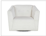
Fabric shown: MI009-03 Spencer Snow