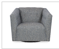
Fabric shown: MP012-45 Tasia Blue