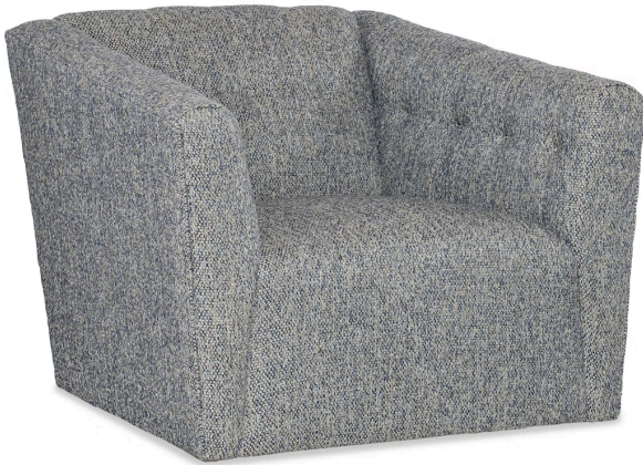
Fabric shown: MP012-45 Tasia Blue