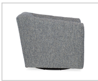
Fabric shown: MP012-45 Tasia Blue