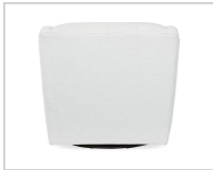
Fabric shown: MI009-03 Spencer Snow