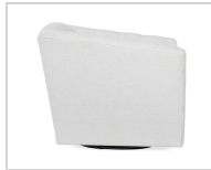
Fabric shown: MI009-03 Spencer Snow