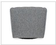
Fabric shown: MP012-45 Tasia Blue