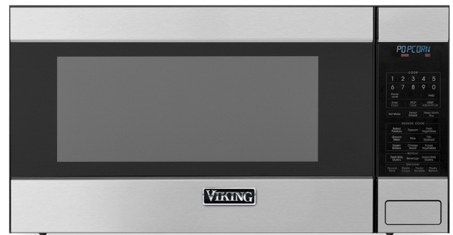
30" Wide Conventional Microwave Oven