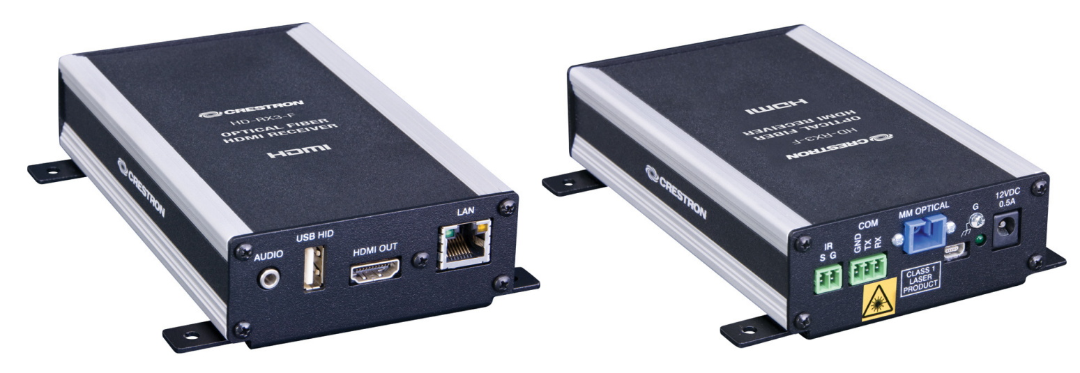
Bottom Panel View