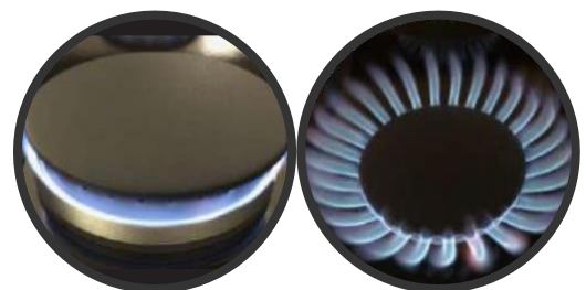
Ultra Low Simmer and High Power Dual Burners