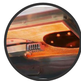
High Power Infrared Broiler