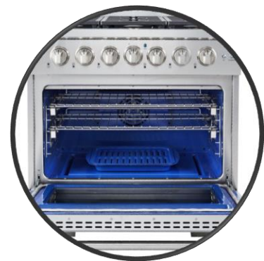
Large Capacity Oven with Blue Interior