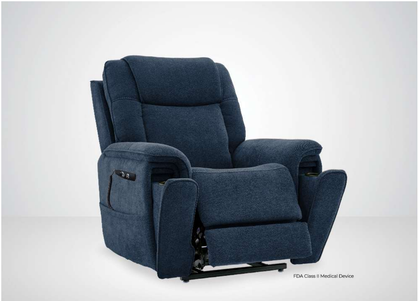
FDA Class II Medical Device