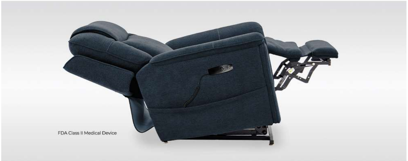
FDA Class II Medical Device