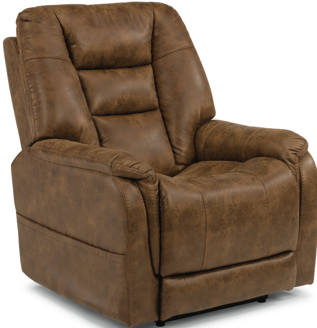
1568-50PH in fabric 374-72