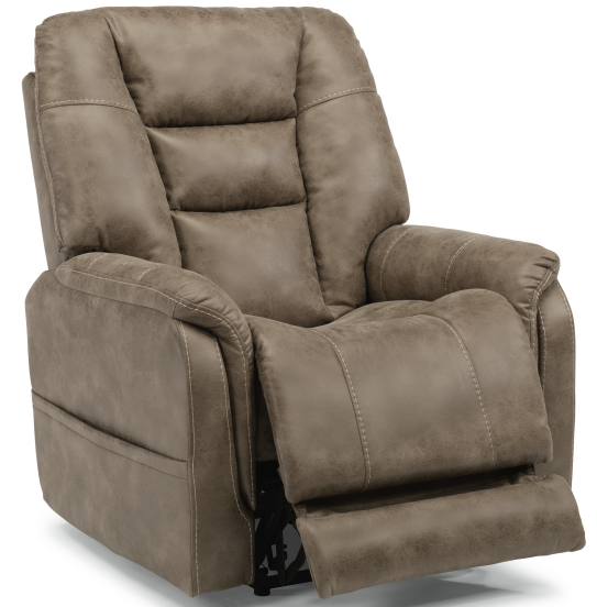
1568-50PH in fabric 374-82