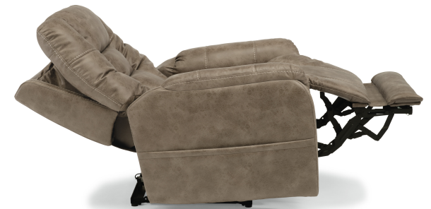
1568-50PH in fabric 374-82