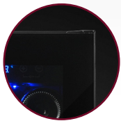
FULL GLASS DOOR