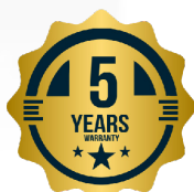
5-YEAR WARRANTY ON COMPRESSOR