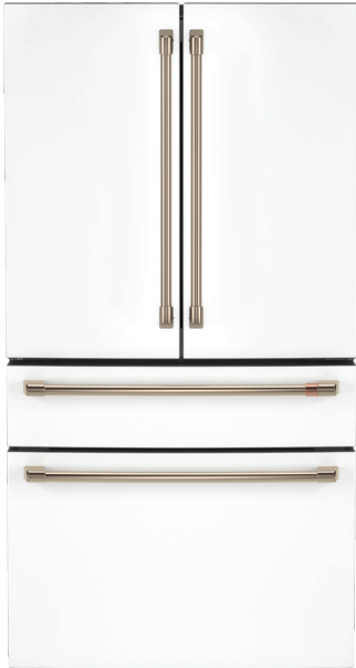
CGE29DP4TW2 Matte White with Brushed Bronze handles