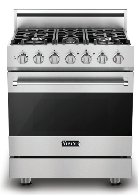
30" Wide Dual Fuel Self-Clean Range (Shown with optional 6" H. backguard)