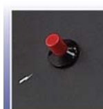
Reli-A-Lite Push Button Ignition System