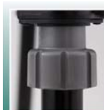
Independent Adjustable Feet