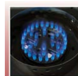
Windproof Burner Technology